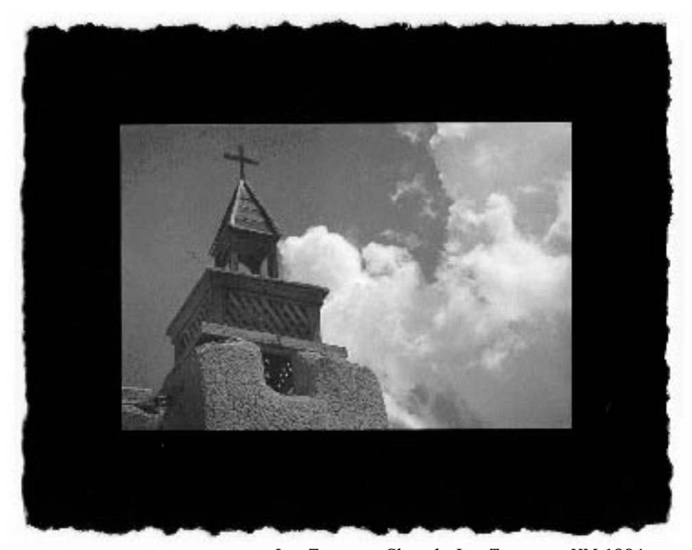
Las Trampas Church, Las Trampas, NM 1994

The film type will give us sharpness, grain, and tonal scale. The paper will also effect sharpness and grain, along with the luminous quality of the print. The coating mixture and developer used will have profound effects on print color, and grain. An often over looked aspect of platinotypes is edge treatment. The edge treatment allows the print maker to give the print many different qualities, ranging from clean edges with the print floating on an oversized paper, to expressive brush strokes. These may even be carried all the way out to the edge of the paper, giving the print all black boarders. These edge treatments allow for the print to have the clean look of a silver gelatin print or the distinctive handmade quality . Highly discouraged, and not offered, is the use of over sprays, dry mounting, waxing, and other presentation techniques that limit the life of an otherwise extremely long lasting print.