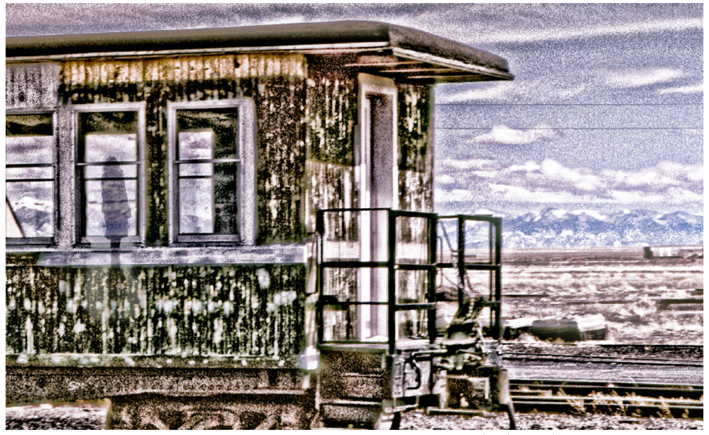
Destination Unknown, CO, 1995