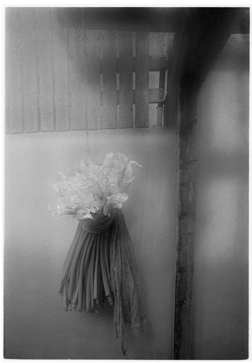
Misty Calla Lillies, Santa Fe, NM

A printers proof print will be made and billed at first print prices when an edition of platinum/ palladium prints is contracted. All subsequent prints will match the OK'd printer's proof (PP). The PP print remains the property of the printer. Subsequent prints will be billed at no more than 2-5 print pricing. The pricing of an edition will be agreed upon prior to printing and pricing will be guaranteed for a period of 1 years. You should use the attached price schedule as a guide in calculating a starting point for edition pricing. Orders of $3000.00 will begin to see discounting. Papers used include but are not limited to: Stonehenge, Platine and Beinfang. The Beinfang paper is an extremely thin paper and does have a higher price for printing due to extra care it requires.