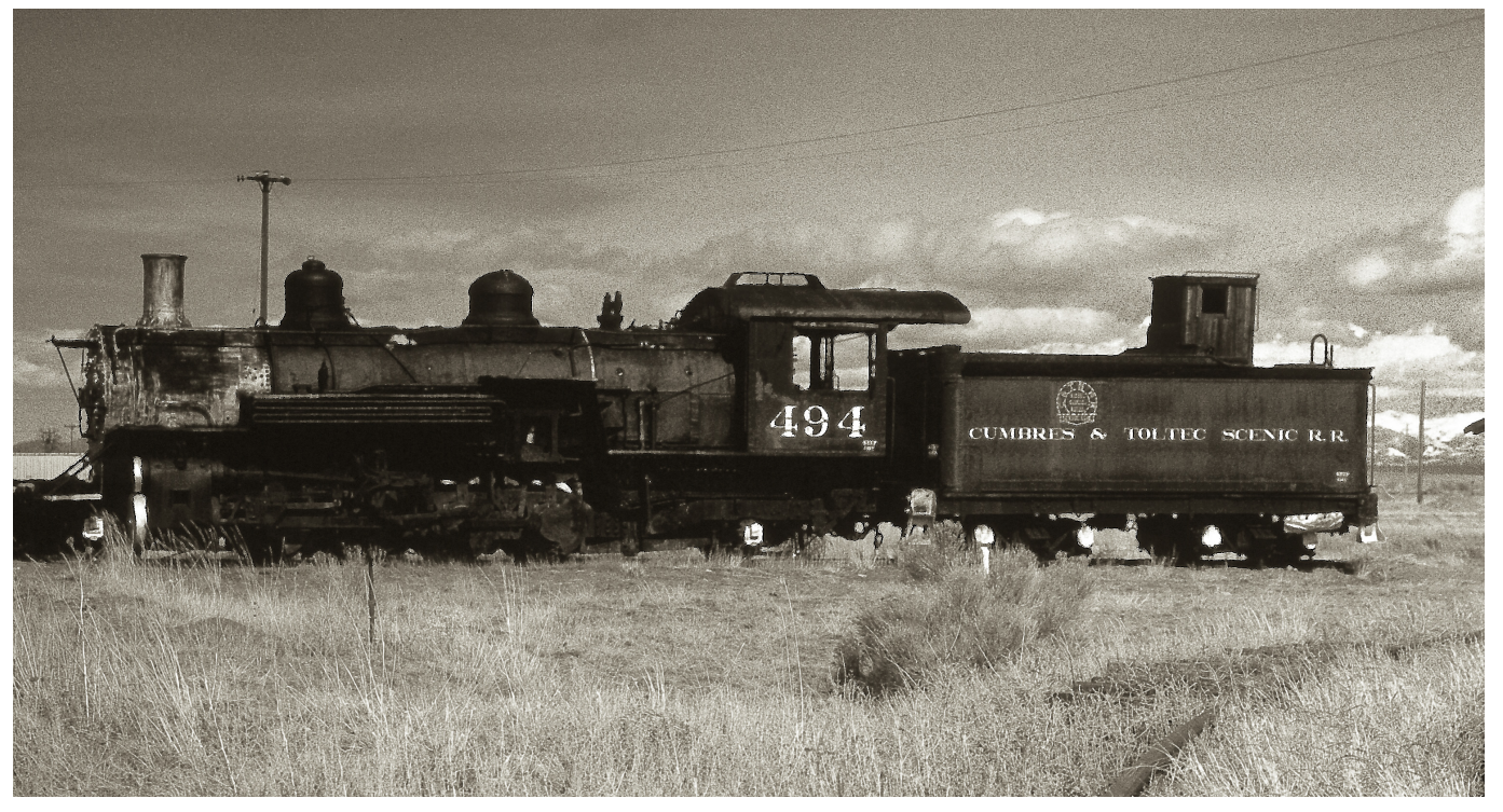
Engine 494, Alamosa, CO