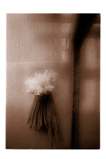
by Eric J. Neilsen

The Noble Print: A Guide to Platinum / Palladium Printing is now in the third revision. As changes have been made to the available materials, I have had to adjust to new film stocks and papers. This is included in all platinum workshops as well as by itself for $35.00. Order now.