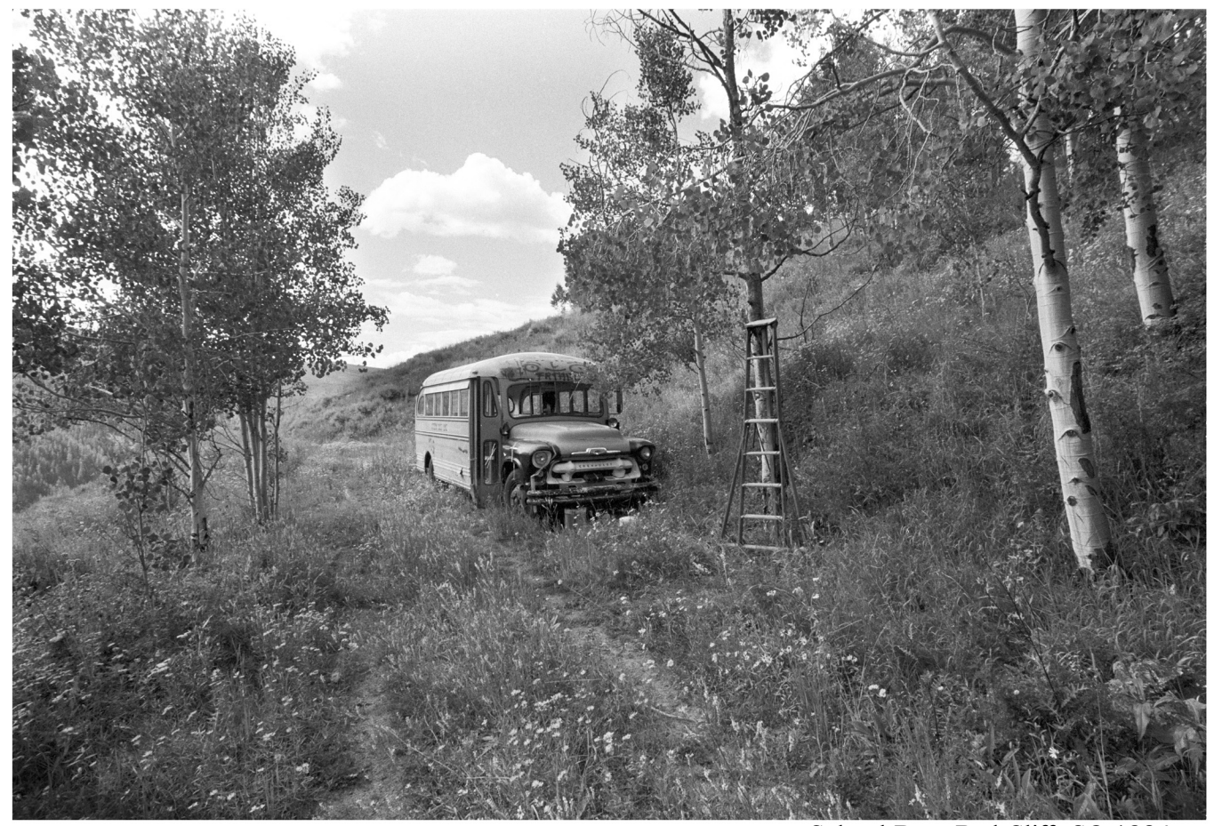
School Bus, Red Cliff, CO 1994