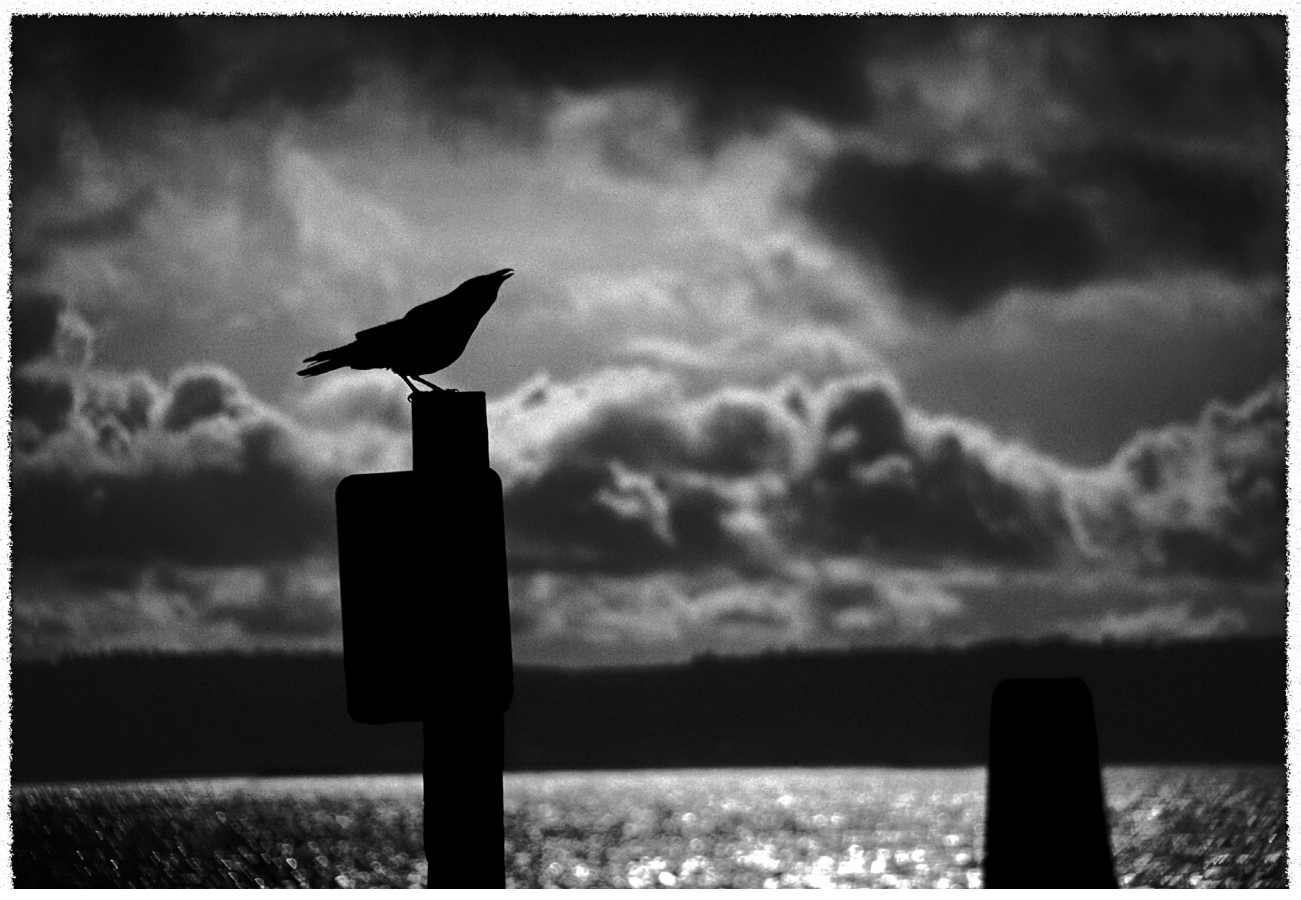
"Crow in Sound", Bremmerton, WA 1982