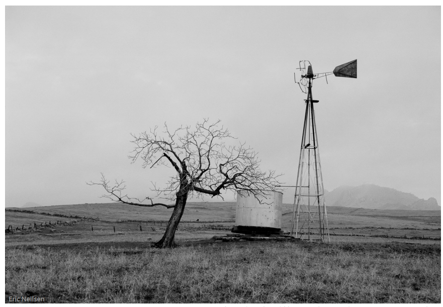
Tree and Windmill, Yuba City, CA 1995